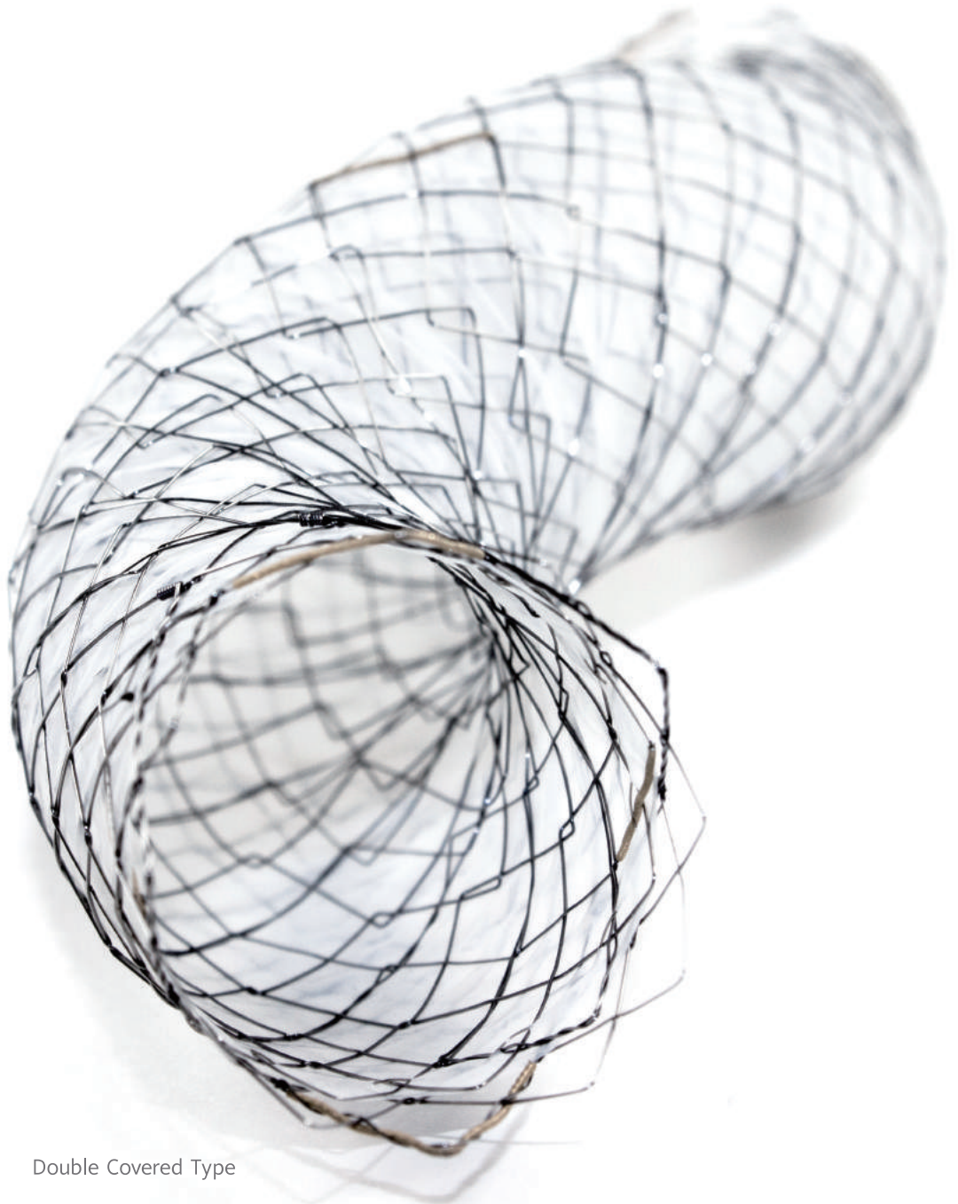
Double Covered Type